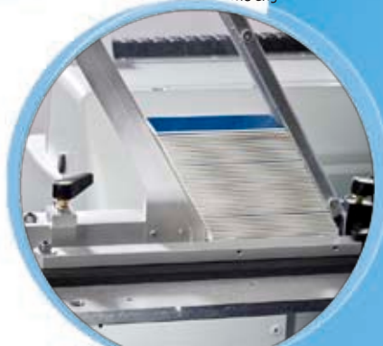
Able to hold over 312 plates