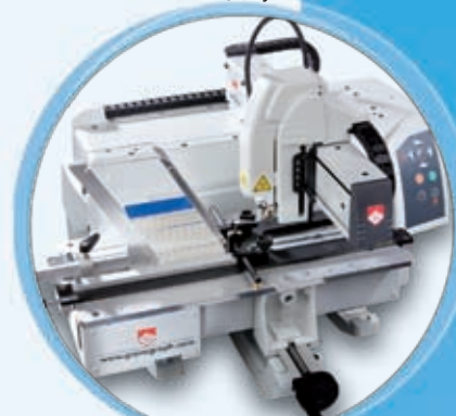
Simply slot APF in vice for high-volume engraving