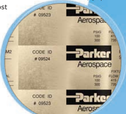
Multiple plate production in a single operation