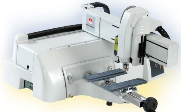
Gravograph M40 engraver from £25 per week*

Call today to arrange a free on-site demonstration.